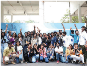
NASA -Annual Event