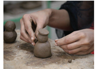
Poornam -Construction workshop