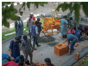
Mannidam -The masonry workshop