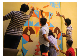
Nirangalidam -The mural workshop