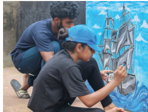
Cherai Olam -Graffiti workshop