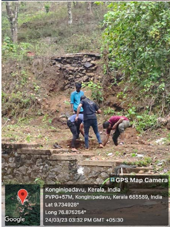
Vegetable garden preparation in campus.24/03/2023