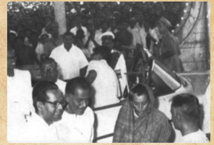
Late DC with Indira Gandhi, the then PM of India