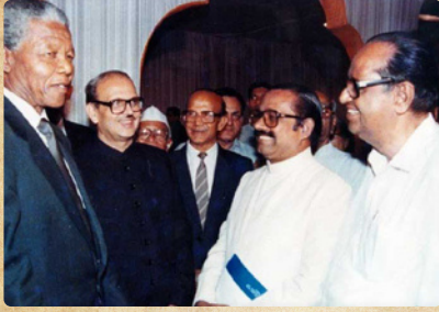
Late DC with Nelson Mandela